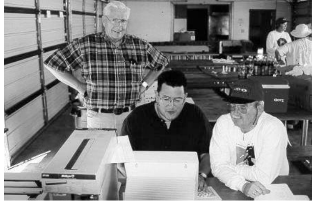
1997 saw a marginally successful use of packet radio. The aid station at the finish line in Midway, shown here, had a networked system in 1998 and was quite successful.

Over 80 amateurs participate, providing stations at the starting line, and the fifteen intermediate checkpoints, and an extensive net control station at the finish line in Midway. Each station has its own personality and its own set of challenges. At the early checkpoints, amateurs must be prepared to catch 200 in-and out-times in a half-hour. At the later checkpoints, operators must keep the station operating for 18 or more hours, including the hours of darkness. Many of the checkpoints are at remote locations that must be reached by four-wheel drive, horseback, or on foot.