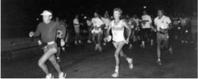
The race begins in the wee hours of Saturday morning. Each runner may have several pacers along the way.

The amateur radio community provides a remarkable service to this event, but what those who enter the race do is, perhaps, even more remarkable. The Wasatch 100 is one of several "ultra-marathons," races well over the length of a marathon, in this case, 100 miles. Yes, that's 100 miles on foot --this is not a bicycle or horse race. And to make it even tougher, the course runs over high ridges in the Wasatch Mountain Range. The cumulative elevation gain is about 26,000 feet, and the cumulative loss is about 23,600 feet.