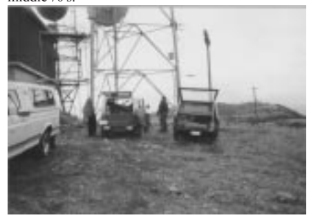
Notice the size of the base of the new 120' tower

We could move to the new replacement tower (120 feet), but we would be expected to follow the normal commercial practices for antenna mounting and feedline support. This meant that we had to come up with a scheme other than the (now rusty) homebrew brackets that had kept our antennas in place since the middle 70's.