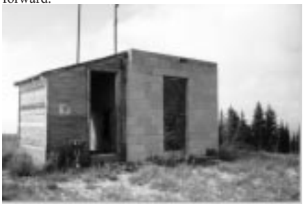
The Scotts Hill Radio Building - Demolished by order of the U.S. Forest Service?

At UARC's annual SteakFry last July, it was voted for the club to proceed with a proposal to build a second repeater on 146.62 to be located on Scott's Hill. This site, on the ridge between Big Cottonwood and Millcreek canyons, would have extended '62's range to include Park City and the eastern portion of 180 in Utah. It now appears unlikely that the project can go forward.