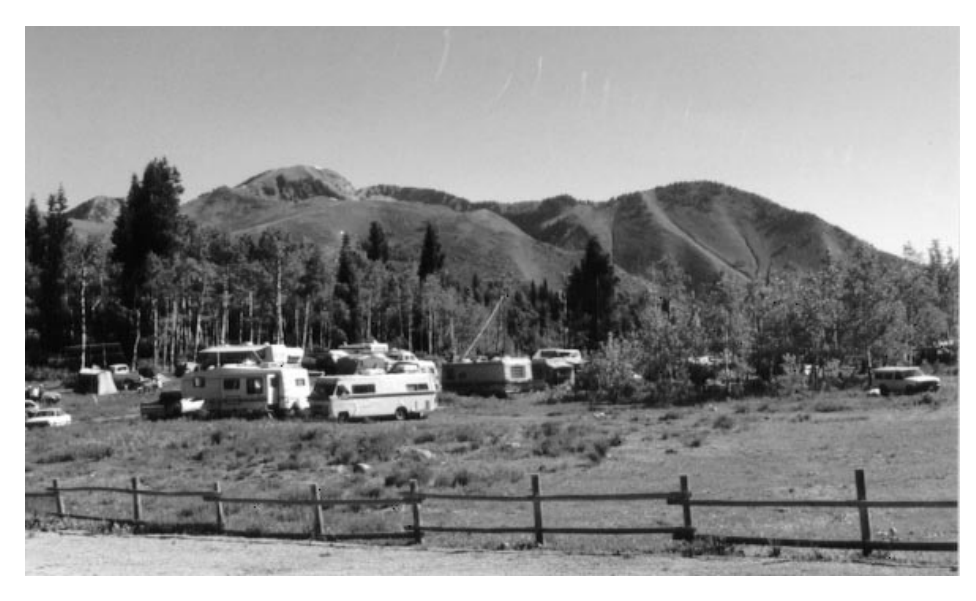
Payson Lakes UARC Field Day '97 Site.