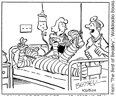
LOOK ON THE BRIGHT SIDE ---- AT LEAST HE CAN WORK C.W.

Editors Note: This situation may possibly be cured before you receive this issue of The Microvolt but then again your '62 engineering team may be worn out from all of the Olympic activities and not want to attempt reaching the mountain top till Spring Thaw.