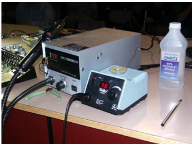
Tony's hot air gun and soldering iron.