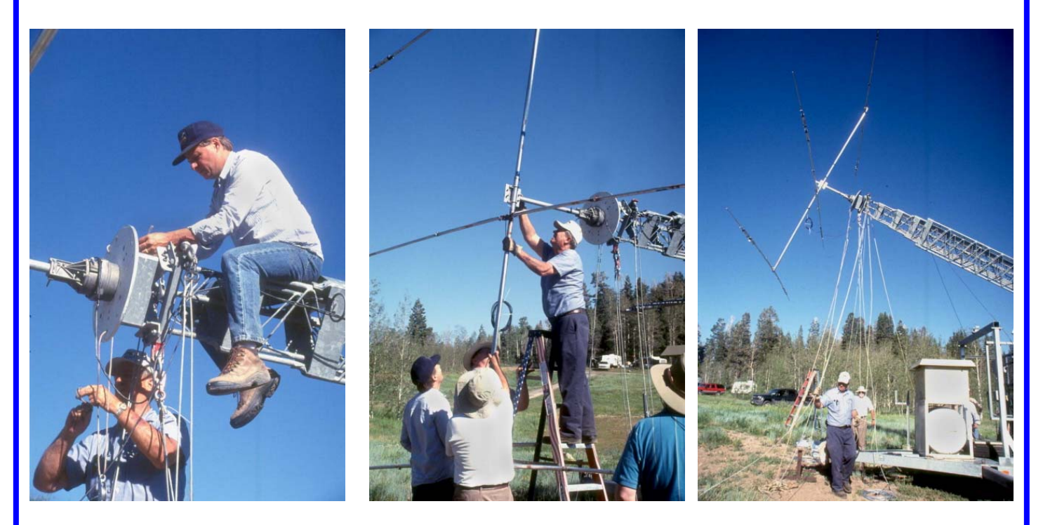
Setting up the tower and eating the Dutch oven dinner