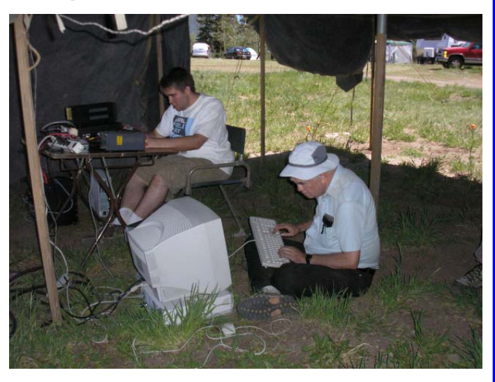
Where are the operating tables and chairs?