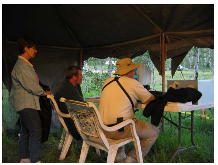
SSB phone station operators