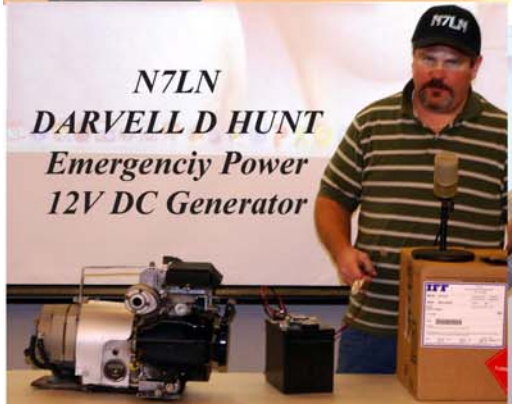
N7LN DARVELL D HUNT Emergency Power 12V DC Generator