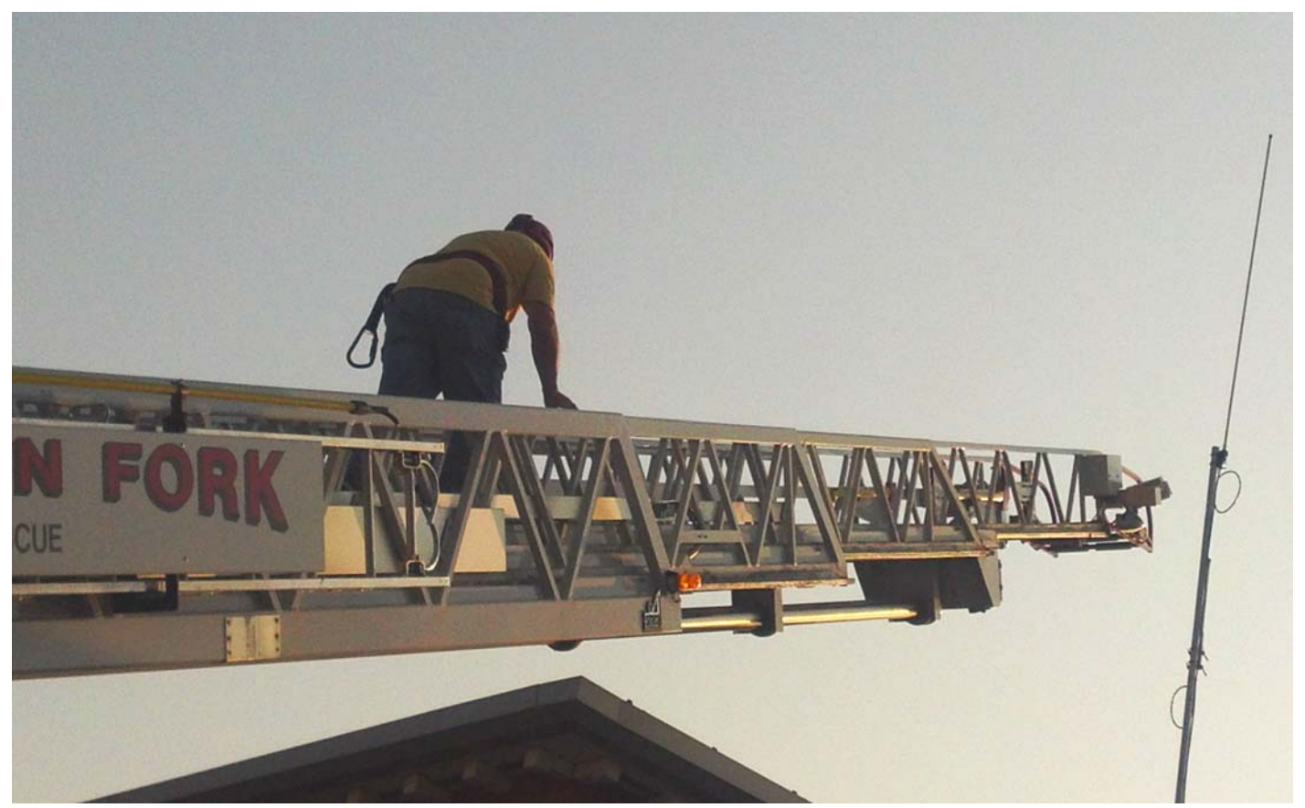
Carl, WE70MG, uses an antenna-installation tool we all wish we had.