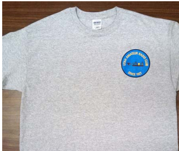
Front View 1