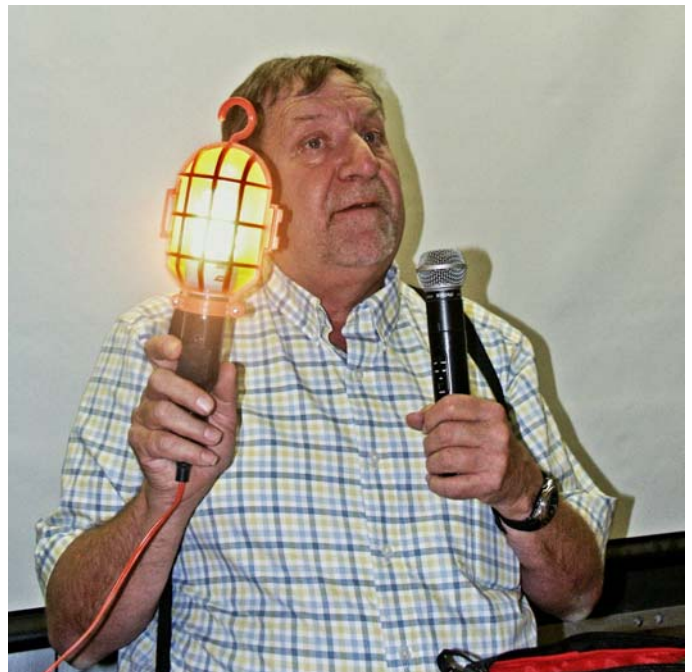
Glen, WA7X, powers a CFL lamp from 12V DC