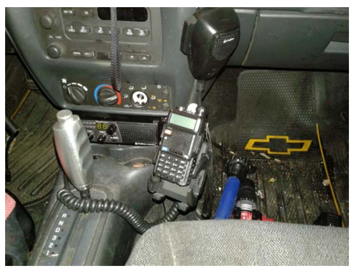
Nathan's Mobile installation