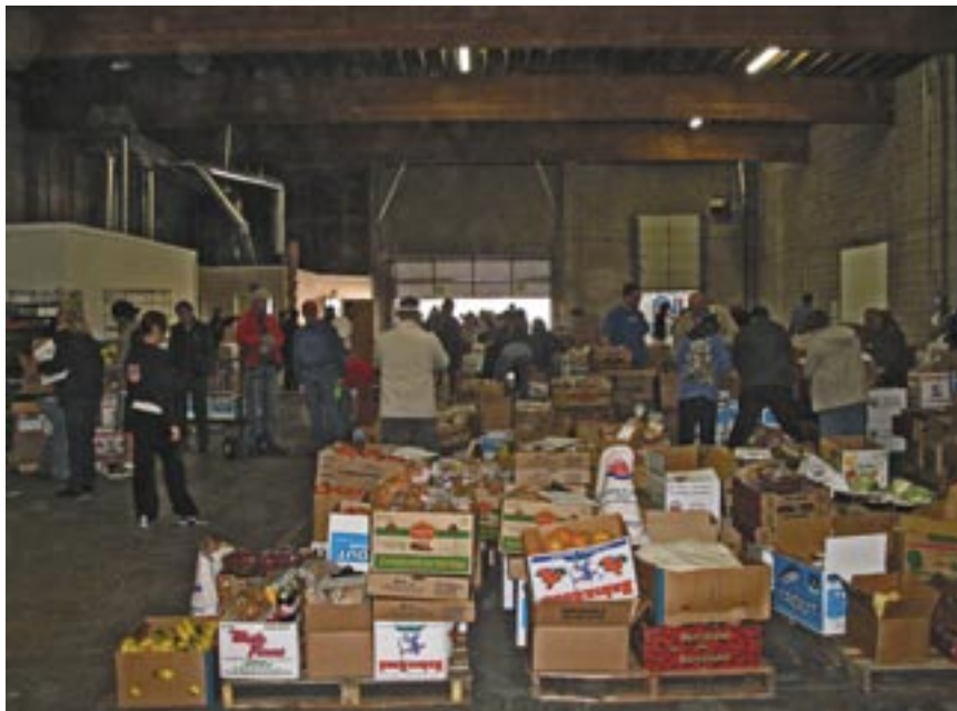
A view of the April 21 st Food Distribution being held for the first time at the Community Food Co-op's new warehouse facility located at 1469 South 700 West. See Page 2 for complete contact information.

April 21, 2007 marked the first Distribution Day at the Community Food Co-op of Utah's new warehouse. The warehouse, located at 1469 South 700 West, is the new home for Food Co-op distributions, bagging parties, and other activities. The space offered by the new location will allow team orders to be filled more efficiently and provide a better working environment for our many volunteers.