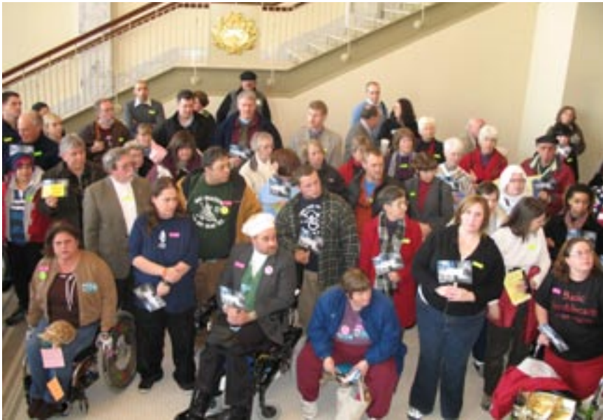
AHAC members and others gather at the State Capitol at the beginning of the 2007 Legislative Session.

On the opening day of the 2007 legislative session more than 100 Utahns gathered at the State Capitol to ask legislators to make 2007 the year that Utah starts to solve its health care crisis. These citizen advocates wrote notes and spoke to legislators about the 25% of Utah residents who cannot afford basic health care.