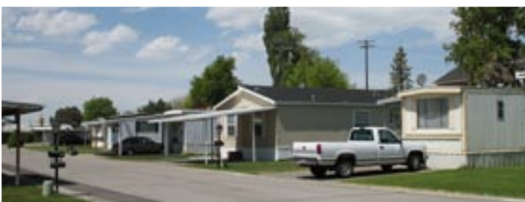
Crossroads' Community Housing Advocacy Project (CHAP) is working with residents in mobile home parks like this one for long term solutions that save people's homes.

Currently, CORC volunteers are working to help Salt Lake City and County officials author ordinances to limit the number of outlets in their respective areas. Also, members throughout the state are being urged to educate their local officials about the predatory nature of this business that traps people in a cycle of debt.