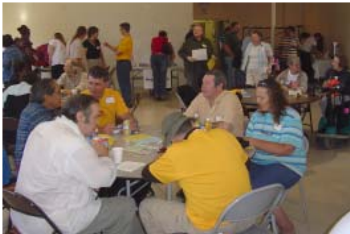
Several AHAC members discuss the results of their discussion groups.

On Saturday, August 28, more than 100 people gathered for The People's Summit on Poverty. This event was organized by Crossroads Urban Center and sponsored by several groups, including the Anti-Hunger Action Committee. The goal of the summit was to bring people from different parts of the community together to talk about what issues matter to low income Utahns and talk about how we all can work together to begin to solve those problems.