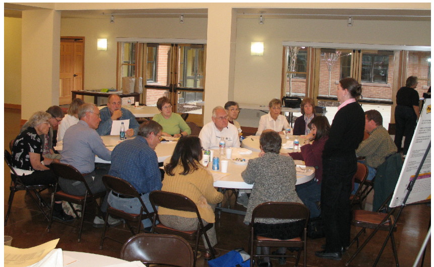
A Break-out group discusses the Sales Tax on Food

The breakout group that discussed sales tax on food decided to go forward in attempts to fully eliminate the state portion of the food tax. The natural strategy for this is to use much of CORC's time and efforts to convince the Senate to agree to remove this tax, as there is already wide support in the House. CORC's plan is to set up a work group that will make specific proposals to the Senate about how to make up the lost revenue that this sales tax reduction will bring the state. To join this group contact Linda.