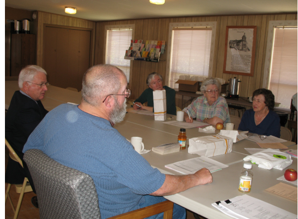
CORC Meeting in Richfield, Utah

All of the meetings on the road trip were very productive. If all goes as planned, work on local payday lending ordinances should begin in each area.