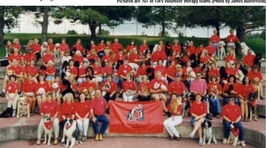
Pictured are 70+ of ITA's volunteer therapy teams