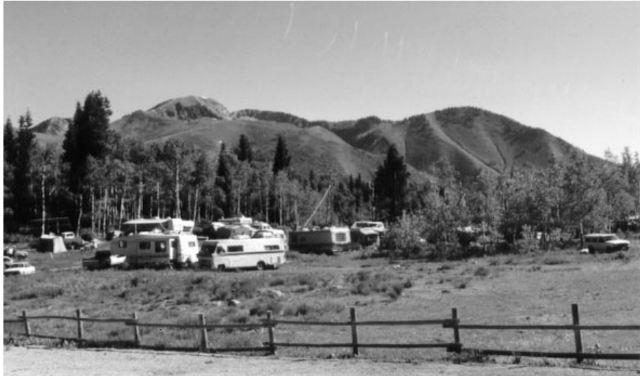
Payson Lakes UARC Field Day '97 Site.