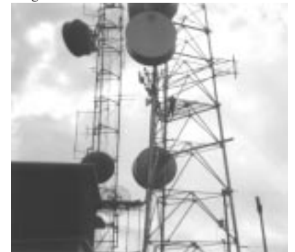
The old (left) and new (right) towers at the Lake Mountain repeater site

The other important site for UARC repeaters is Lake Mountain, home to the 146.76 repeater. Our first clue that something was happening came when we received a phone call telling us that the 100foot tower on which our antennas were mounted would be coming down in two weeks.