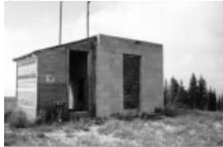
The Scotts Hill Radio Building - Demolished by order of the U.S. Forest Service?

At UARC's annual SteakFry last July, it was voted for the club to proceed with a proposal to build a second repeater on 146.62 to be located on Scott's Hill. This site, on the ridge between Big Cottonwood and Millcreek canyons, would have extended '62's range to include Park City and the eastern portion of I80 in Utah. It now appears unlikely that the project can go forward.