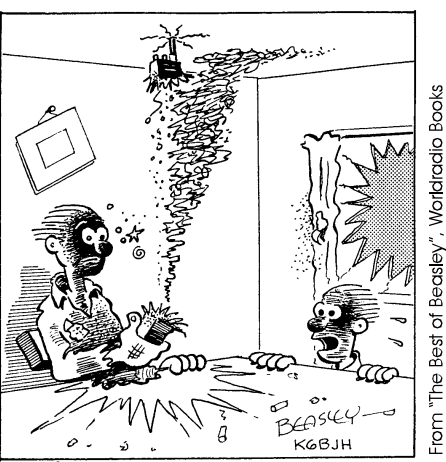
WOW! NOW I KNOW WHAT THEY MEAN WHEN THEY SAY "BE SURE TO OBSERVE POLARITY WHEN INSTALLING BATTERIES!"

Interested parties should contact me via e-mail at wh6yt@arrl.org. I am working on a website and will have that up and running shortly.