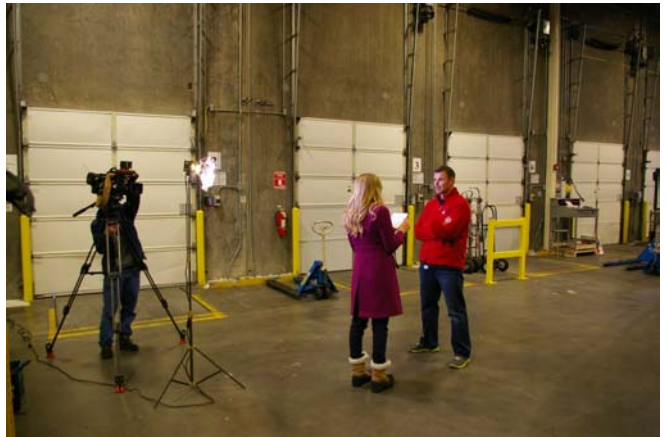
Channel 4 was present.

Later on, one of the locations requested another trailer and more "totes". Again there was a discussion about the need for the additional resources (fuel and driver costs). The communications allowed various persons including one of the drivers to evaluate the situation and dispatch another truck (they had begun to stack food wherever they could since the totes were completely full).