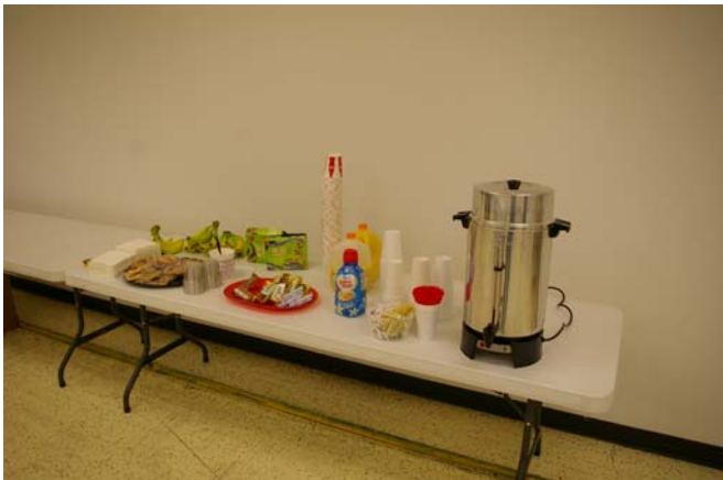
Operators have a need for food too.

It was an interesting deployment of the amateur radio resources. We had to set up in cold, wet weather, operate where some radios didn't reach the repeater, work out packet functionality issues, and still have a good time. In the end, we all learned something, had a good time and nobody got hurt.