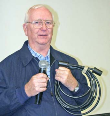
K7XTC's method of using film cans for weather protection.