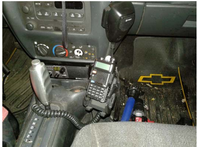
Nathan's Mobile installation